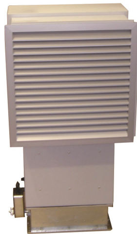
External View Showing Weather Louvre

All products are manufactured from Zintec Steel and polyester powder coated to RAL 9010 - Special colours are available on request