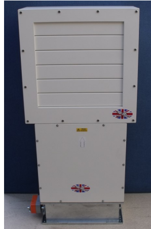
Internal View Showing PRD and FE Unit

For more information on any of our products or services please visit us on the Web at: www.pumaproducts.co.uk Telephone + 44 (0)1264 333305 sales@pumaproducts.co.uk